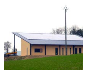
Municipal Technical Center in Larajasse (FR)