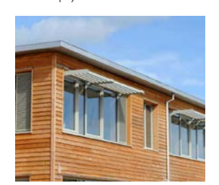
Oakmeadow Primary School Wolverhampton (UK)