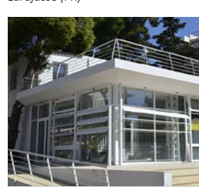
Municipal Library of