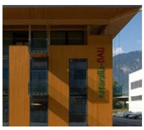
Naturaliabau Merano (IT)