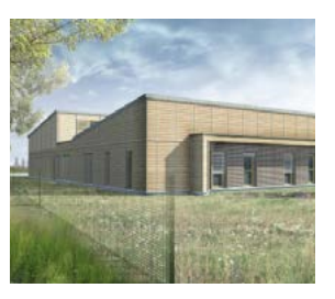
Criirad passive office building